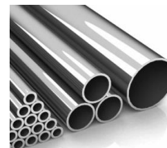
Tube & Pipe